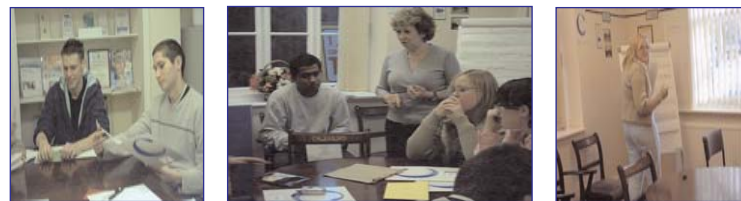
Young Carers Council

Ref: Young Carers Research Group in association with Crossroads (1994) 'Getting it right for young carers - a training pack for professionals' in 'Young Carers Strategy 2000- 2003' - Wiltshire Young Carers p8.